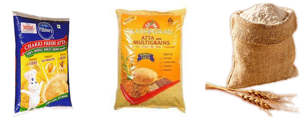
Figure 6: Branded and Unbranded Wheat Fluor

Pillsbury wheat Chakki fresh atta or ITC's Ashirvaad Multigrain atta have to comply with FSSAI rules and regulations. However, "loose" items, an euphemism for locally processed items escape these stringent quality control. Processed items available at MGP like Lokwan Wheat Flour, Sihor Wheat Flour, Besan etc., are without any such certificates. Although every attempt is made by MGP to have proper quality control the systems are more experiential than scientific, more traditional than rational and generally based on consumer feedback. The local kirana stores also offer these "loose" items, which come without FSSAI certificate but have the seller's "guarantee" of good quality!! The current middle class, upper middle class and the millennial are very brand, health and quality conscious and this category of consumers may not be keen on MGP product offerings due to perceived quality issues.