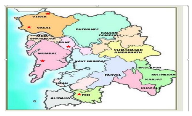
Figure 3: MGP Distribution Centres in Mumbai Metropolitan Region

each being located in Vile Parle (W), Thane, Vasai, Palghar, and in Pen. Each of these centre cater to the consumers residing in the geographical areas closest to service. The process of distribution and collection of requisition and payments remains the same. Every month on an average around 94 grocery items are offered to the member consumers. About 20% of the high consumption items like wheat, wheat flour are repeated every month but less consumed items like pulses, toiletries, personal care products are repeated after two or three months. Members fill in their requisitions and make the computations of their monthly item wise bills, as the approximate prices for each item is clearly mentioned in the requisition.