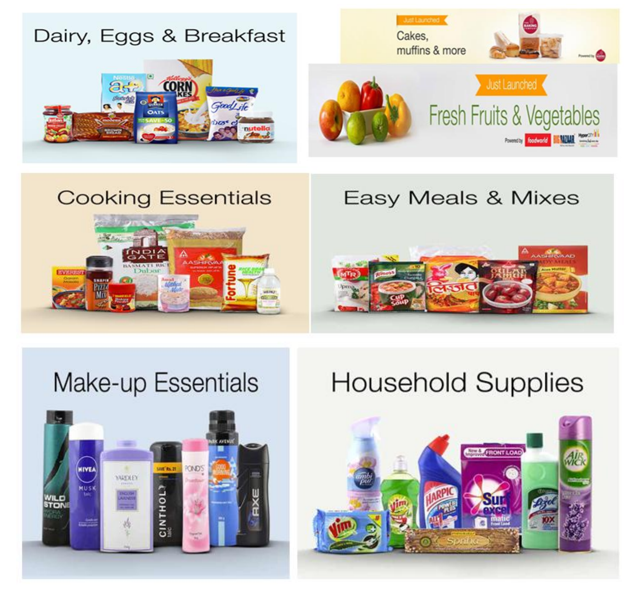
Figure 4: Cross-section of Products being offered by Amazon Now on their App

Likewise Big basket also offers over 18000 items on its website under various product categories, exclusively falling under the household grocery items list and offering many choices in each category. The major difference between the MGP model and those followed by Amazon Now, FlipKart, Big basket is