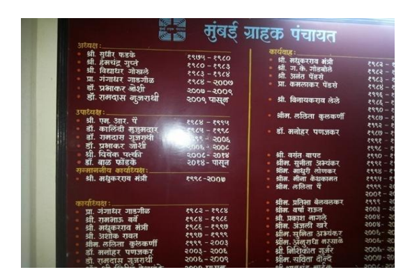
Figure 1: List of Present & Past Office Bearers of MGP

In the early 1970's, the third decade of independence, Indians faced shortages of essential commodities, food grains, and in general all household items including groceries. Added to the shortages was the scourge of hoarding, black marketing, cheating on prices, adulteration as well as fraudulent weight measurement practices. Quality of the items purchased were never commensurate with the prices paid and most traders out to make a quick buck could manipulate the same.