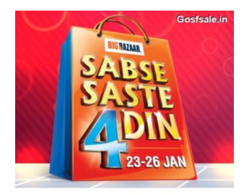
Figure 5: Big Bazaar Sale Offer

Similarly all Ecommerce websites like Amazon Now, Flipkart, Big Basket offer various schemes to attract consumers. Whether these schemes make economic sense or not, the schemes can be quite disruptive for low cost models like MGP distribution model. There are other household items that require periodic purchases like clothes, bed sheets, pillow covers, disinfectants, soapsandtoiletries, fresh produce, fruits and vegetables, wet groceries, etc., which is not available at MGP as a result of which the consumer has to use other available options. At these times, the consumers also end up buying the products offered by MGP elsewhere.